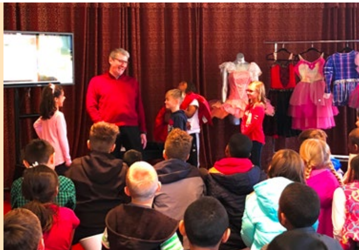
2019 Coronado Classroom Photos

Truly one of most unique student experiences in our region is the Coronado Classroom Education Center . The Classroom brings individual school classes to the Coronado for an informal and interactive experience. Through our photo archives and artifacts and guest presenters, it is a unique approach to bring history to life. We compare Coronado history with local and global events. Here are the kind of topics we talk about: