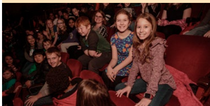
2019 REACH for the Stars Photos