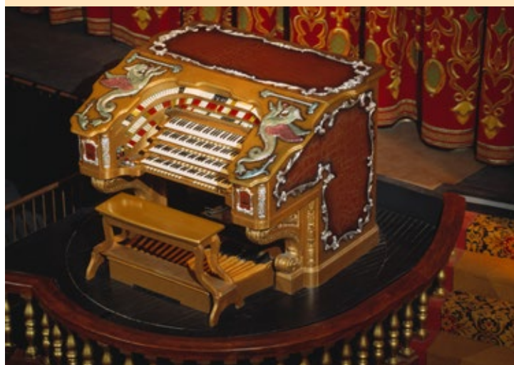
The LOLTOS Grand Barton Organ

Photos, newspaper clippings, and firsthand accounts of the Coronado's history from the LOLTOS archives are on display for the public's viewing in the Coronado Classroom Education Center of the Coronado Theatre. It's truly an exceptional display of living history.