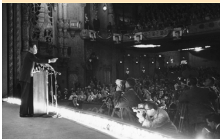
Presidential Candidate John F. Kennedy, 1960

For more information to plan a visit to the Coronado Education Center please email bhoward@coronadopac.org or call 815.847.6314